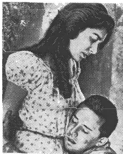
Helpless and bound to a tree is the Girl (Virginia Leith), as her amorous young captor Pvt. Sidney (Paul Mazursky) makes a frantic plea for sympathy in Stanley Kubrick's "Fear and Desire," a drama of escape, which will open on . . . at the . . . Theatre.