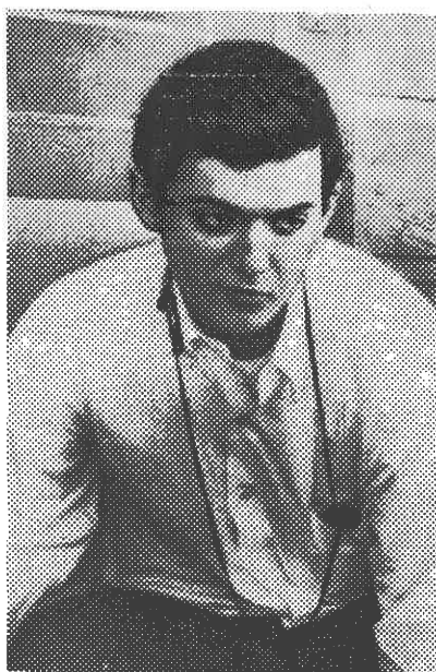
Stanley Kubrick, 24-year-old Producer-Director of "Fear and Desire," explains a scene to an actor. The film, a story of four desperate men and the strange half-animal girl they take prisoner, will open on . . . at the . . . Theatre.